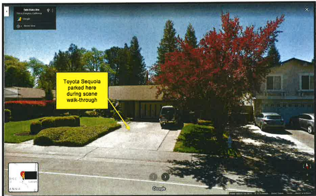
[REDACTED] Twin Oaks Avenue, Citrus Heights (Front of Residence)